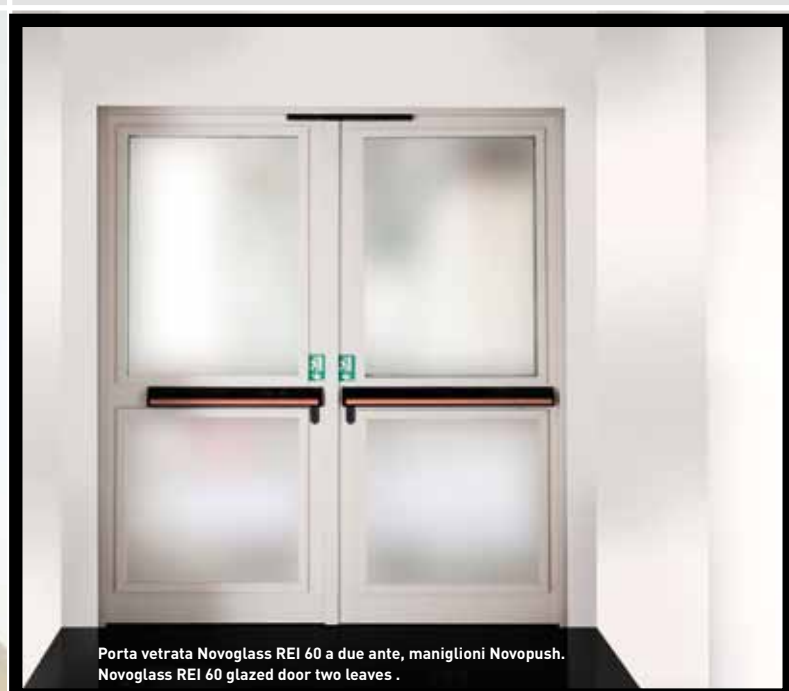
Porta vetrata Novoglass REI 60 a due ante, maniglioni Novopush. Novoglass REI 60 glazed door two leaves .