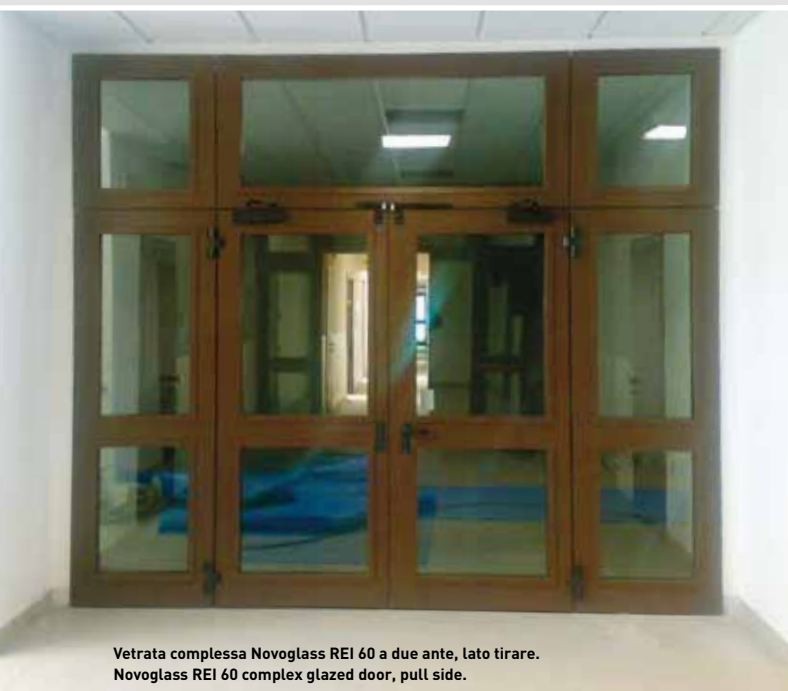
Vetrata complessa Novoglass REI 60 a due ante, lato tirare. Novoglass REI 60 complex glazed door, pull side.